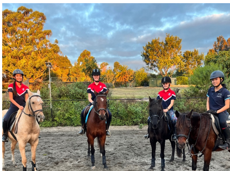
The Pymble crew riding with our new members Archie and Sebastian.